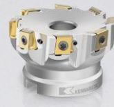
Mill 4™-12KT Promo Kit